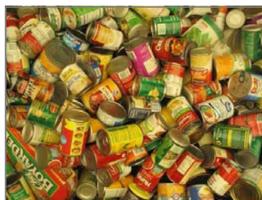
The Canned Food Drive is On!

► Bulk trash pick up is the first full week of each month. Watch for reminder signs near the front entry gate.