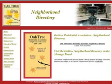
Online Neighborhood Directory

"Streamlined Oaktree website access makes it easy for everyone to be connected and find the information they want"