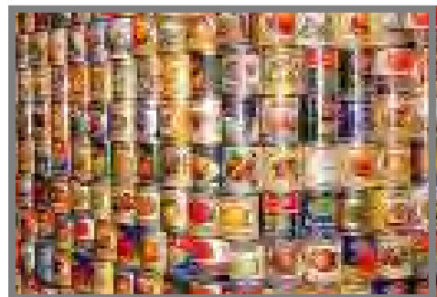
Food Drive Starts April 12th

► Submit neighborhood news for the next issue of the online Oaktree Shade newsletter to: info@oaktreehomeowners.com .