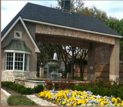
Spring is here!